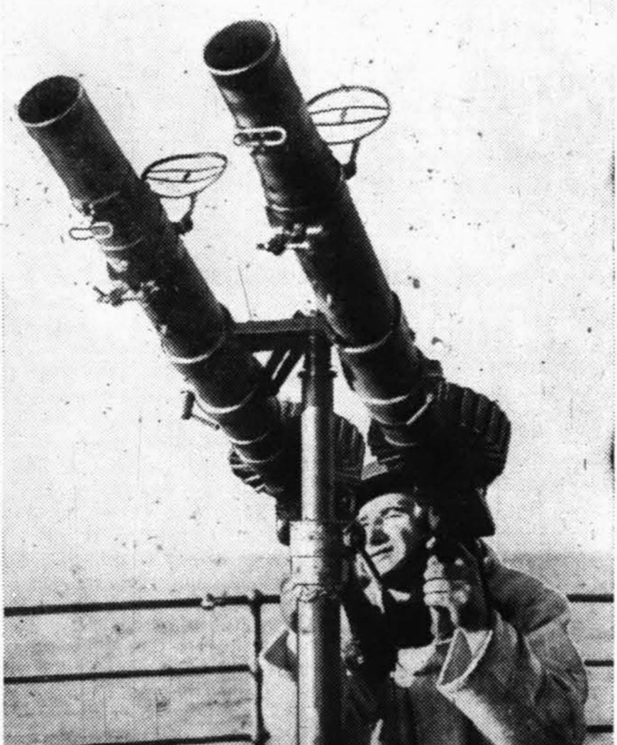
With a British convoy. The various types of gun used by the British Navy are proving very effective against the menace of German U-boat and air attack on British convoys. An expert naval gunner sighting a twin Lewis gun on board one of the protecting vessels of the convoy.