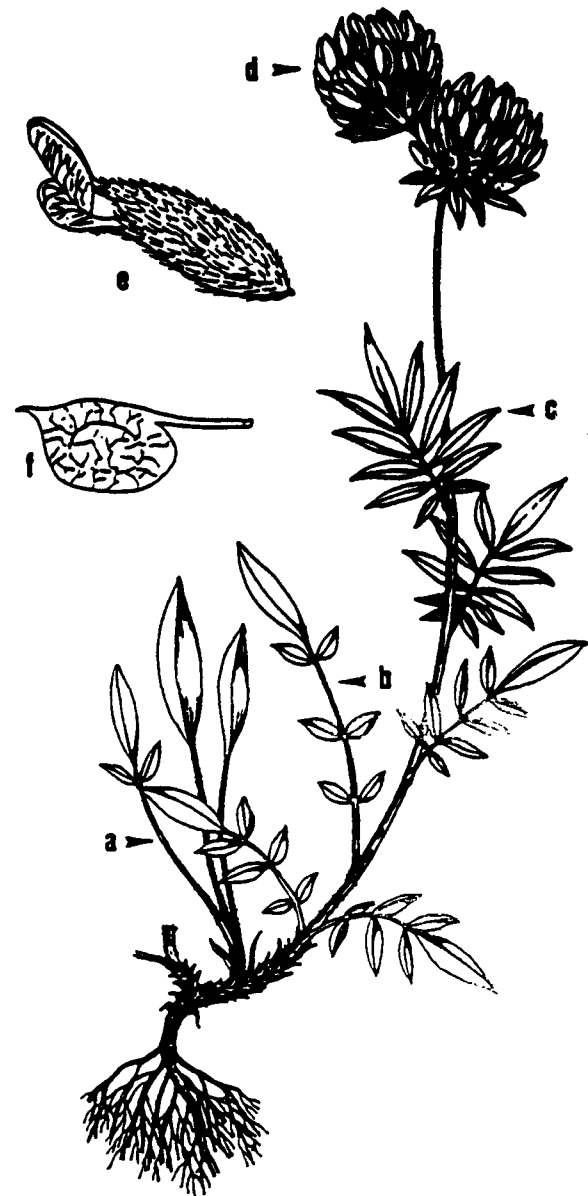
Figure 1: Anthyllis vulneraria L. a. basal leaf b. lower stem leaf c. upper stem leaf d. inflorescence head e. individual flower f. young seed pod (legume)

Figure 1d shows a plant with two flowering heads (inflorescences), but in our variety the stem may be elongated with up to five such compact heads. Branches may also arise from the axils of the upper stem leaves, each often bearing several such inflorescences. Beneath every head occur two greenish bracts divided into a number of "fingers" (figure 2). The shape of these bracts is important for detailed identification of the subspecies (varieties).