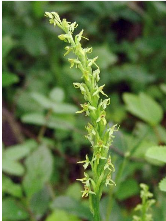
[Left] Platanthera huronensis : Whole plant. [Right] Platanthera aquilonis : Inflorescence.