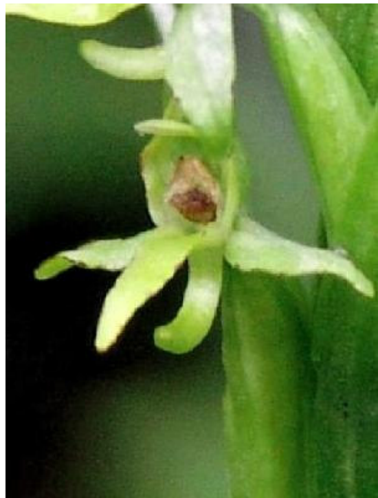
Platanthera huronensis generally exhibits a broadly dilated lip base [left], while Platanthera aquilonis generally exhibits a rather narrow one [right]. Note also: the whitish-green flower colour of Platanthera huronensis and the yellowish green colour of Platanthera aquilonis .