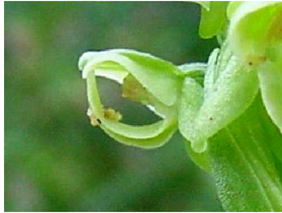
Platanthera aquilonis flowers, from the side, showing [left] a pollinium beginning to droop, on its flexing caudicle, towards the stigmatic surface below; and [right], loose pollen masses lodged upon the still undescended, connivent lower lip.