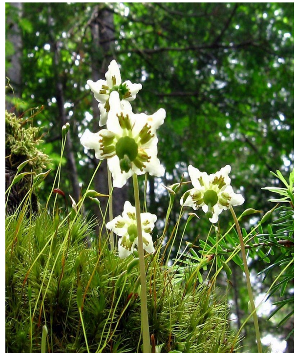
Moneses uniflora Daphne Gillingham