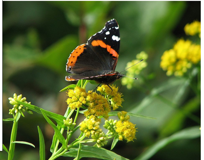
Red Admiral on Euthalmia graminifolia .