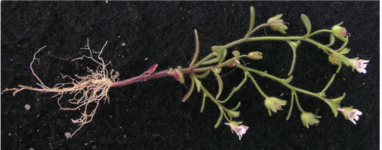
Figure 1: Ready for the herbarium.

This small snapdragon is a “come-from-away”, probably introduced to the Island in relatively recent times. The first occurrence on the Island was reported from a disturbed area around a commercial building in Stephenville in 1997 (Meades et al. 2000). More recently a second population was located at Norris Point in the gravel parking areas around the main wharfs. Specimens from both locations are deposited in the SWGC Herbarium (Fig 1). Because it is a diminutive plant with small flowers inhabiting disturbed places and poor rocky soils, it may have been overlooked by individuals who often pay scant attention such locals and to “insignificant weeds”. I suspect it is more common than we are aware. Originally introduced from the Mediterranean region of Europe, it is found throughout Canada and the U.S.A. Being a small annual it is not usually considered a serious weed of gardens and agricultural fields where it can easily be controlled by