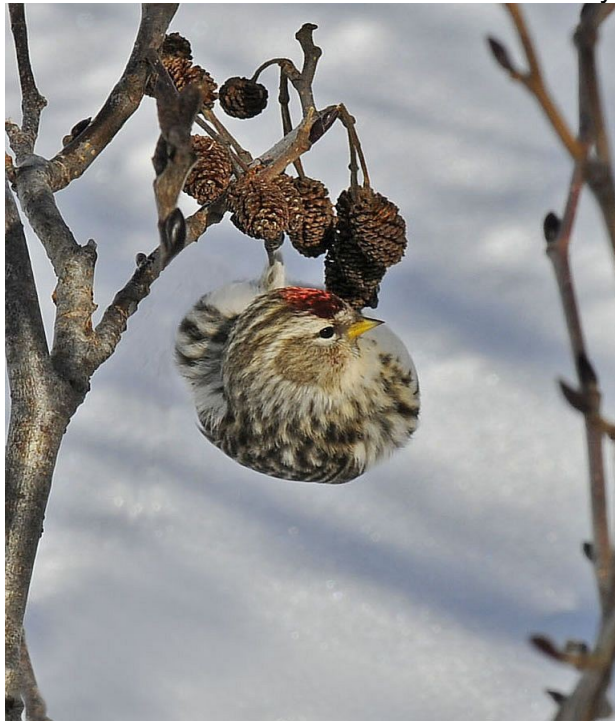
Plant-Animal Interactions - 2nd - Judith Blakely

Our regular Christmas Slide Show will go ahead, as usual, at our December meeting.