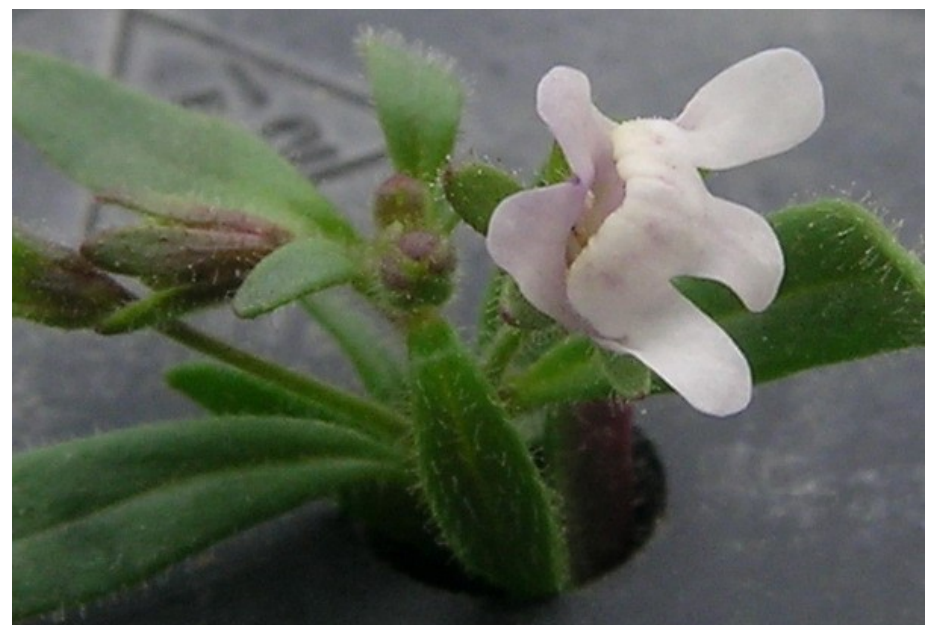
Figure 2: The open mouth.

unbranched or only sparingly branched from leaf axils. Leaves are up to 2.5 cm long, narrow, stalkless, smooth-margined and pubescent. Lower leaves are opposite while the upper ones become alternate. Stems are covered with short glandular sticky hairs.