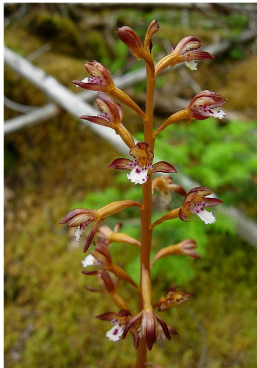
Coralrhiza maculata Heather Saunders