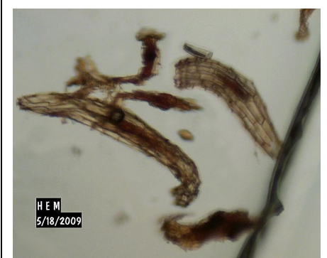
Figure 4: Seeds recovered from 2008 seedpods. Two mature seeds (upper R one with tip broken off) and clumped immature seeds.

collapsed, as in past years. However, when examined after snow-melt, May 2009, 2 of the thin seed capsules of one spike had splits, suggesting they may have released some seeds (Figure 3). Henry Mann examined these capsules and recovered clumps of immature seeds and a few mature seeds from them (Figure 4).