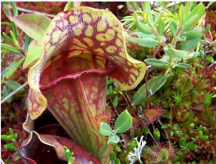
Sarracenia purpurea and other bog plants