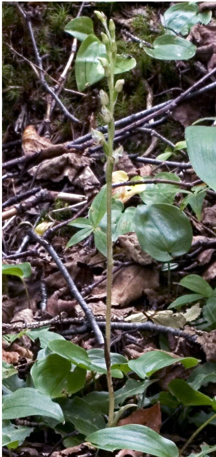
Figure 1: Flower spike at beginning of flowering, 05.08.13

flowers open from below upwards, the last one withering in early September, about four weeks after the first bud opened. The entire spike is dead by the last half of October. The number of flower spikes for this population of 40-50 plants has varied from 0 to 3 each year.