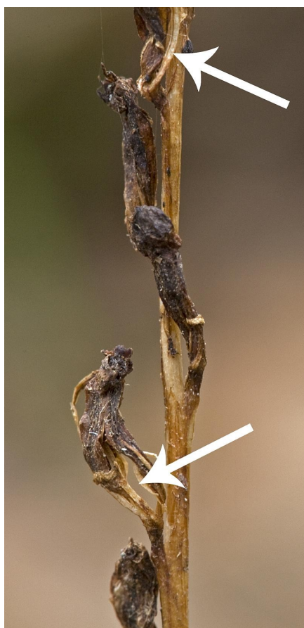
Figure 3: Overwintered flower spike from 2008, photographed 09.05.17. Note two of the thin ovaries have split (arrows), as if they had released seeds.

Up until now, no flower on any of the spikes produced seed. In 2008 there were 3 spikes, 2 of which