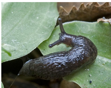
Figure 2: Deroceras laeve on leaves of G. oblongifolia .

Not all inflorescences lasted: of the 8 spikes seen to grow over 4 years, 4