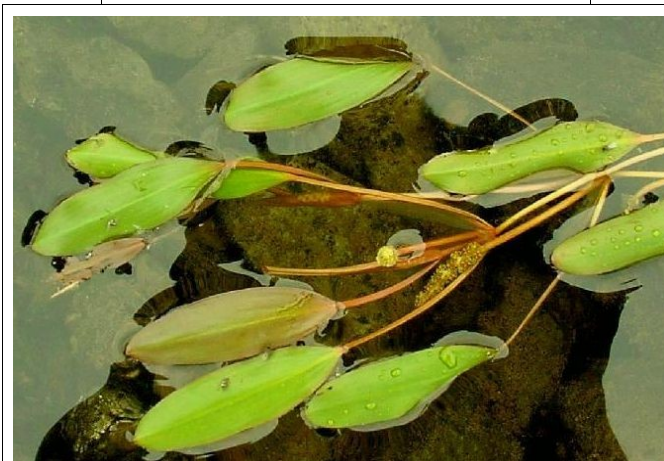
Figure 2: Potamogeton epiphydrus .

Rushes and sedges were abundant all around us, looking vibrant after a brief morning shower. From this magical little watering hole, where a few fairies must surely linger late of an