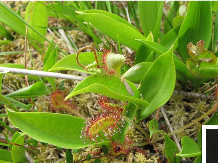
Plant-animal interactions: Heather Saunders, Lacewing on Round-leaved Sundew ( Drosera rotundifolia ).