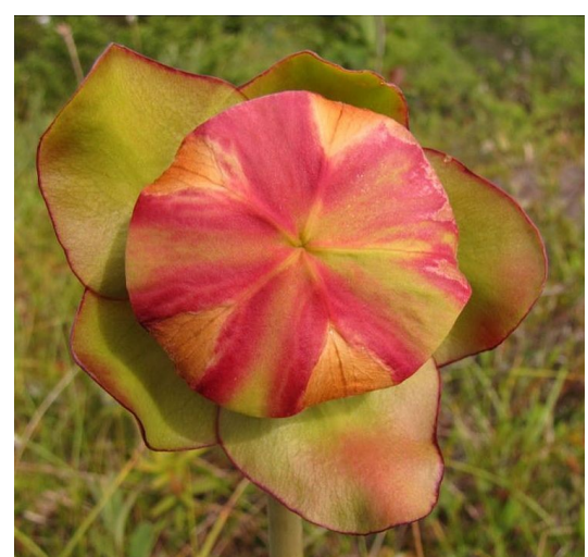
Artistic Abstract. Heather Saunders Pitcherplant ( Sarracenia purpurea )