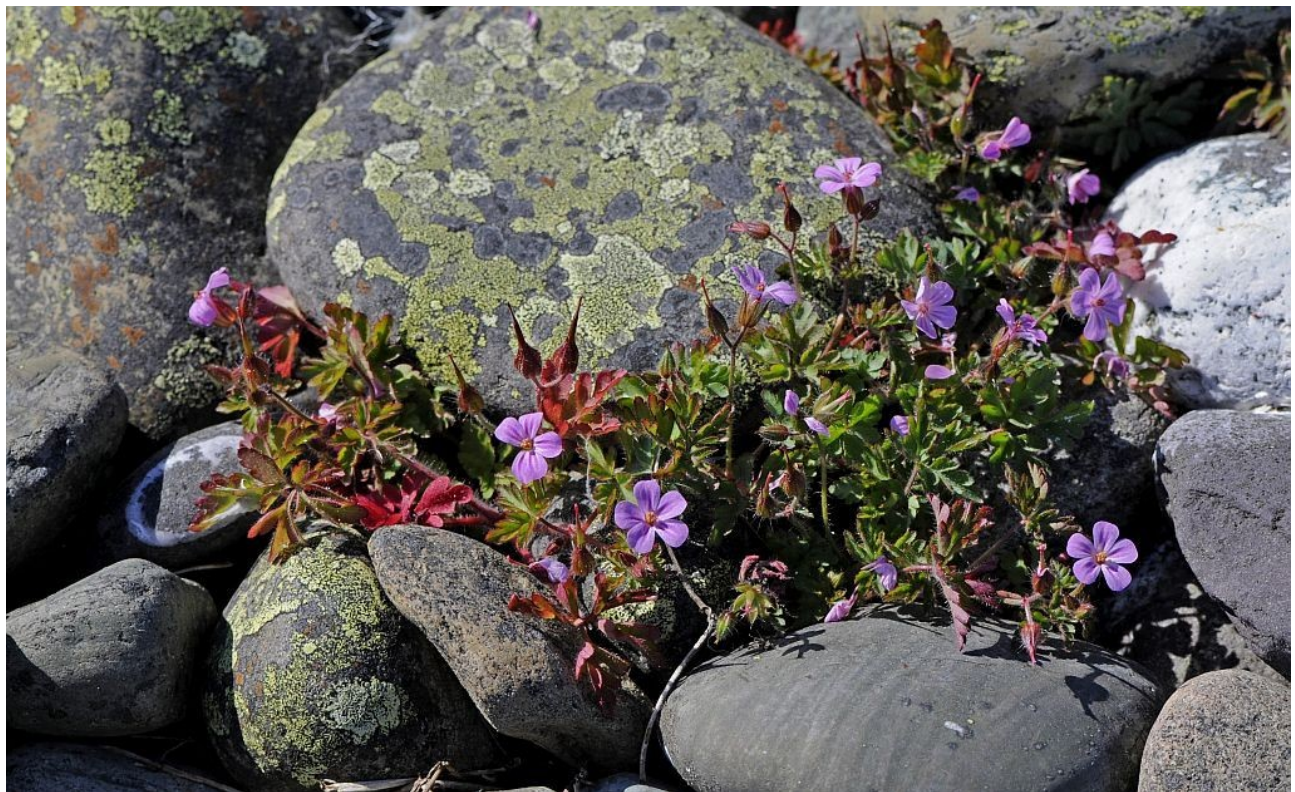
Geranium robertianum & Rhizocarpon geographicum at Point Verde, (see p. 54)