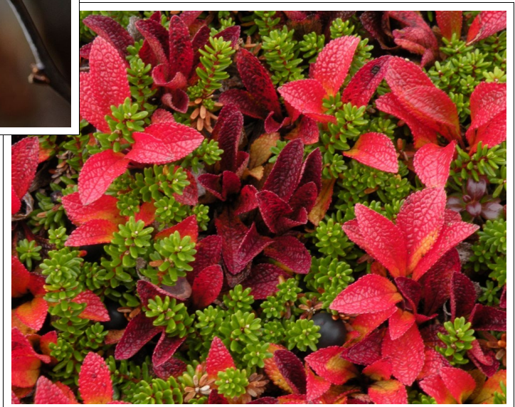
Other aspects: John Molgaard Arctic Bearberry, Arctous alpina & Black Crowberry, Empetrum nigrum