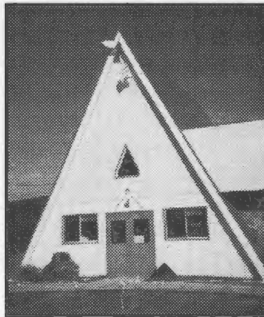
Miner's Museum, Baie Verte, Site of French Shore Interpretation Centre, July 1997

Dreams of an "official opening" for the following season (1998), replete with "distinguished guests," collapsed when expansion plans for the Miner's Museum forced the removal of the French Shore Interpretation Centre. Fortunately, promotion of the French Shore was rescued from oblivion by two of Baie Verte's hotel enterprises. The Baie Vista Inn welcomed a major French Shore display featuring various additions and improvements. Another, smaller exhibit was mounted in the lobby of Bailey's Dorset Country Inn.