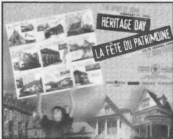
Heritage Day Poster, 1999

Heritage Canada made a major departure in its 1992 poster. It commissioned Manitoulin artists to paint a picture depicting some of the heritage of Canada's