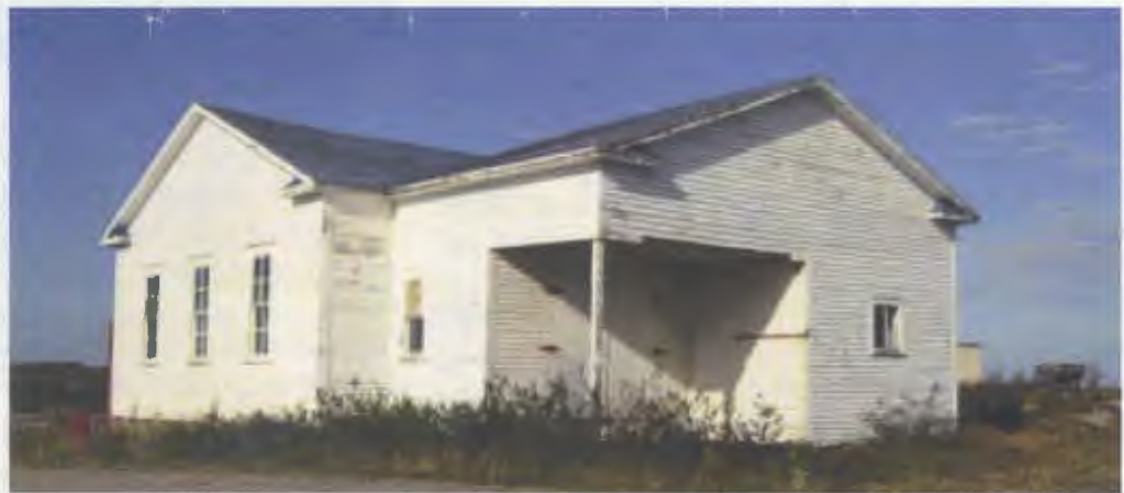
Wesley Hall in Wesleyville was included on the 2012 Buildings at Risk List.

Natural disasters, neglect and demolition of historic buildings result in the erosion of our built heritage. Over 20% of Canada's historic buildings have already been demolished.