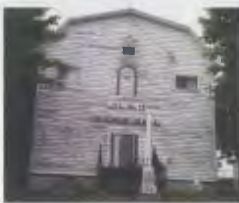
L.O.L. No. 13